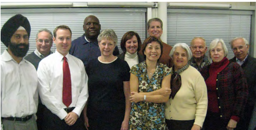
FY11 Board of Directors